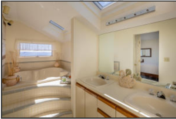
The master bathroom features dual vanities and a jetted soaking tub.