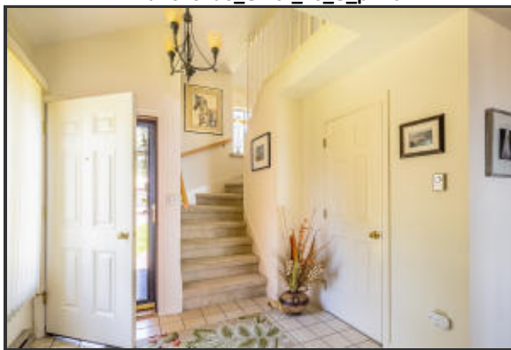
Main entrance off the back of the condo with a nice tiled entry.