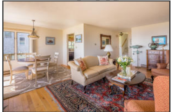
Standing just inside the door to the deck with the dining area and kitchen in the distance.