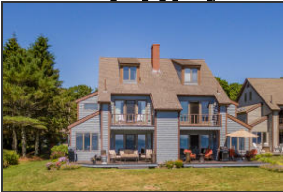
Looking straight at the condo from the ocean side of the property.