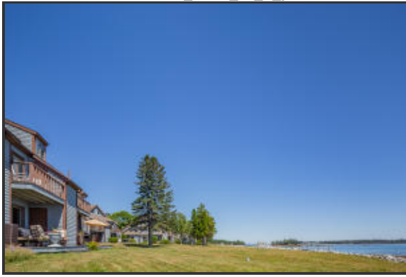
Looking north across the front yard. Condo deck and master balcony to the left.