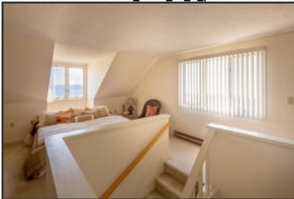
This is one of only a couple units in the complex that offers a completely enclosed third floor bedroom or bonus room.