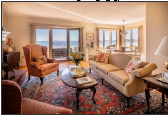
The nice sized living room is the perfect place to sit and relax.