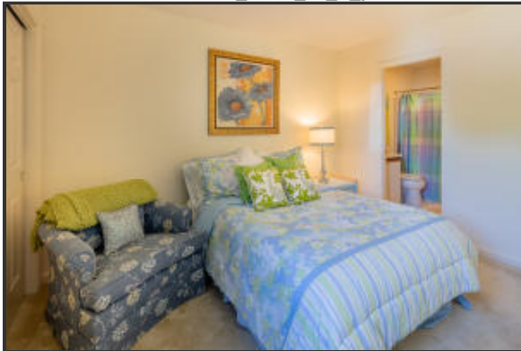
Guest suite on the second floor.