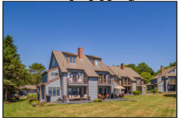
The 3-story condo offers plenty of space for friends and family offering 4 bedrooms and 3 full baths.