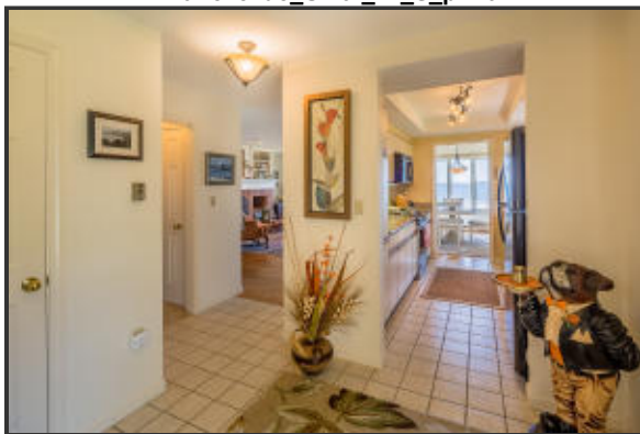
The galley style kitchen is straight ahead as you enter with the views and dining nook in the distance. The living room can just be seen off to the left.