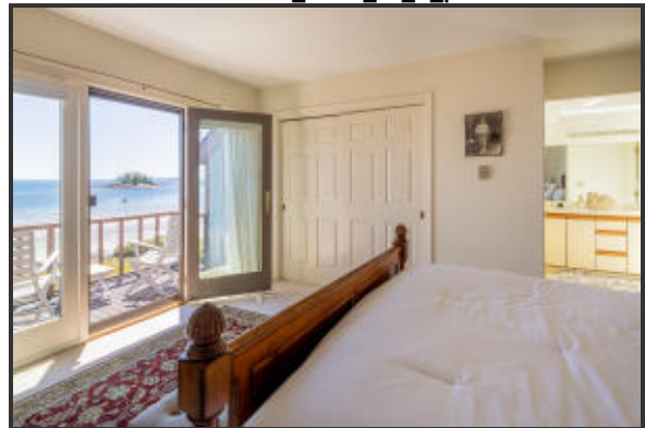
Master bedroom on the second floor with views out front and master bathroom off to the right.