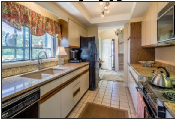
Looking back through the kitchen towards the main entrance.