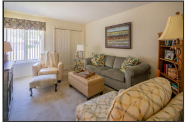
This first floor bedroom, currently used as a den, has a full bathroom just outside its door.