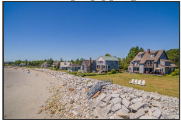
The association has shared access via these stairs down to the beach and water's edge.