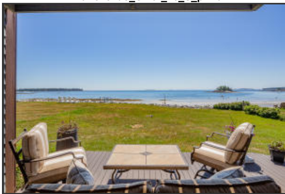
View from just inside the condo looking out at the nearby islands.