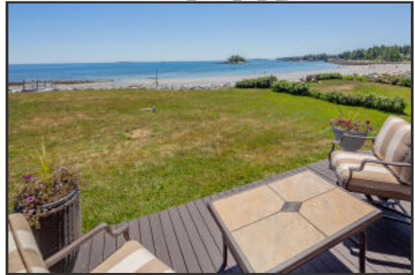
Imagine starting your day with a cup of coffee looking out over the Muscle Ridge Channel or perhaps ending it with your favorite cocktail!