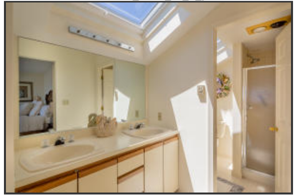
The master bathroom also features a private shower.