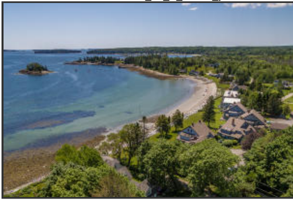
The Crescent Beach Condos sit on one of the most beautiful beaches along the coast of Maine.