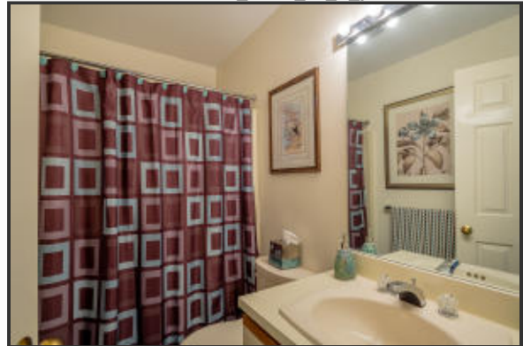
First floor full bathroom.