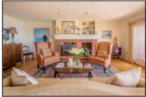
The brick fireplace makes a beautiful focal point.