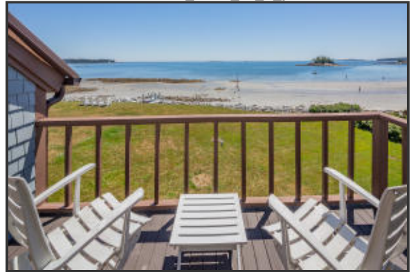
The master balcony overlooks the beach and islands.