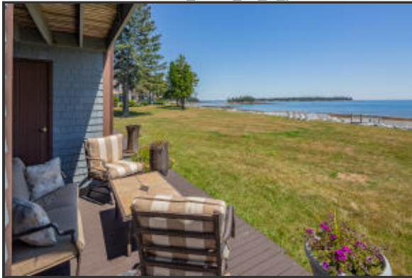
Standing on the deck looking north.