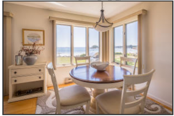
Stunning views from the dining area.