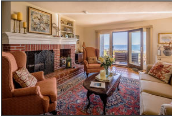
The wood burning fireplace is the perfect way to warm things up on a cool fall evening.