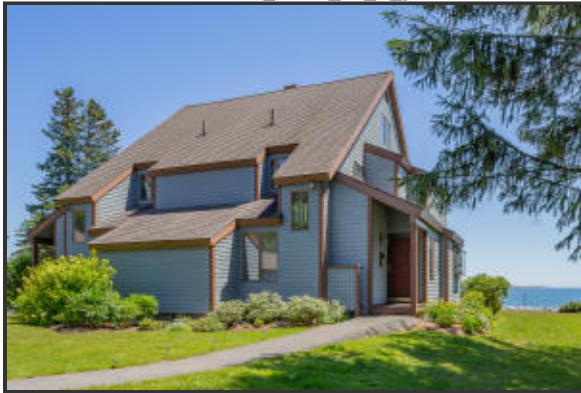
View of the condo as you approach from the driveway.