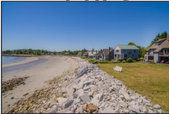
Looking south over sandy Crescent Beach, one of Maine's best kept secrets! The condo is the end unit on the right of the photo.